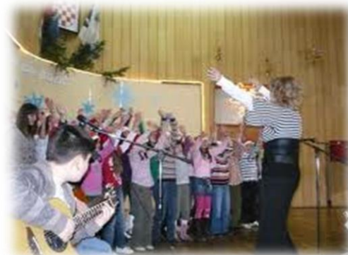
Two school choirs, official and religion